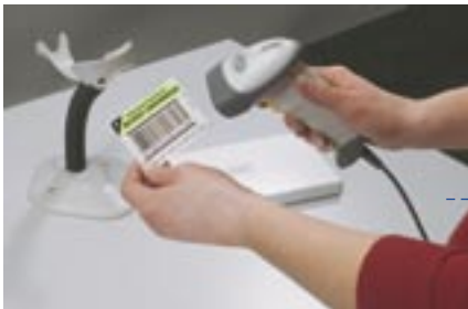
Barcode Scanner Scan accounts with Budget Manager quickly and accurately